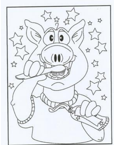
Turn the water off while you brush your teeth!

How can you, your family and friends help save water?