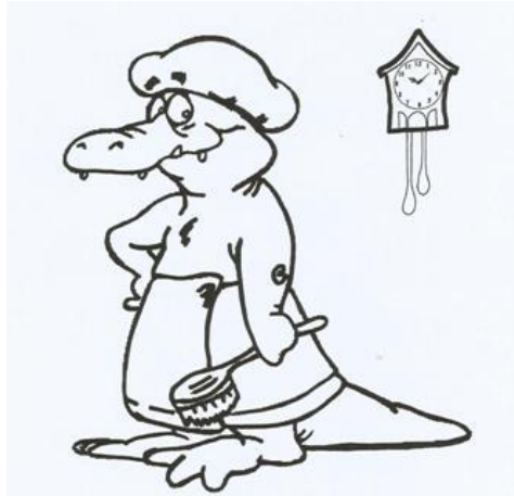
In and out of the shower in 5 minutes saves water!

Answers to the questions are on the Leader's Notes!