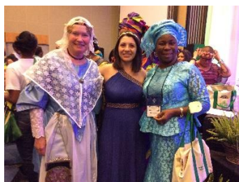
International Conference – Brazil 2017