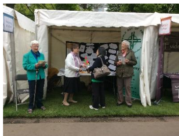
Heart and Soul Princes Street Edinburgh 2017