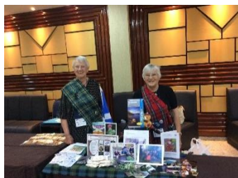
International Conference – Showcase of Scotland