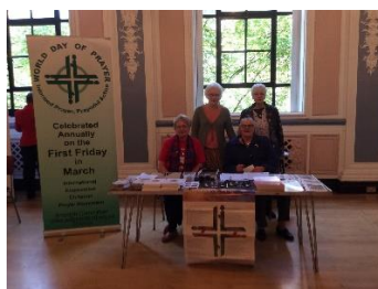
Showcasing World Day of Prayer Church of Scotland Guild Dundee 2017